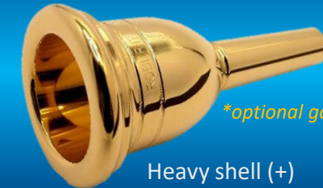
*optional gold plated