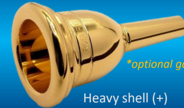
*optional gold plated Heavy shell (+)