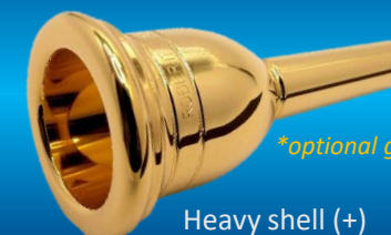
*optional gold plated Heavy shell (+)